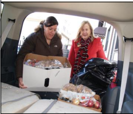
Preparing GPT Food Baskets