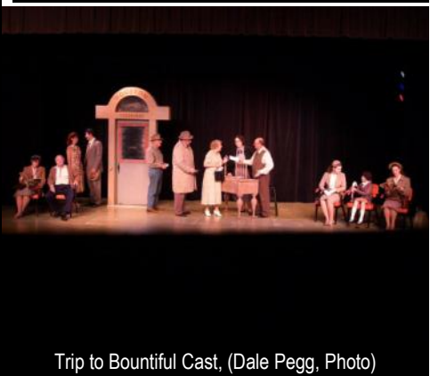
Trip to Bountiful Cast, (Dale Pegg, Photo)