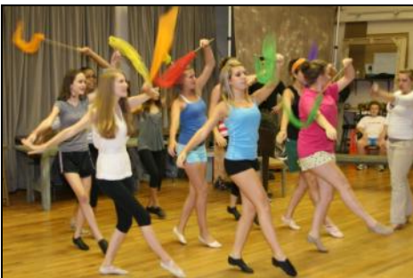
Dance rehearsal: The Music Man