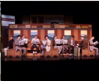
'Cash for the merchandise..'