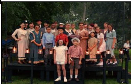
Talking Headstones Cast