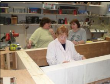
Scene shop, Bountiful