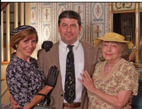
Trip to Bountiful—Some of the cast, and in rehearsal

In lieu of a Holiday Party, the GPT family is going to bring a little joy and happiness to those less fortunate this holiday season- we will be Adopting a Family (or multiple families... depending on volunteers). We are planning a social get together for last minute finalizations on Monday, November 28th at 7pm. The details of the program are still being sorted out, so please keep an eye out for the GPT Weekly Update, so everyone can help out with this important cause.